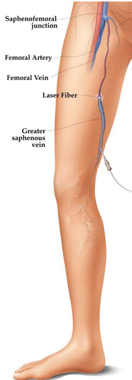
An example of one type of treatment used for varicose veins.

Variable size varicose veins scattered over the calf and thigh may be eliminated via two small skin incisions alone, with a powered mechanical aspirator system (Trivex), in contrast to the multiple incision wounds in the standard surgical procedure. A strong light-source inserted under the skin through one of the incisions illuminates the varicose veins, which are eliminated with a thin mechanical aspirator inserted through the other incision.